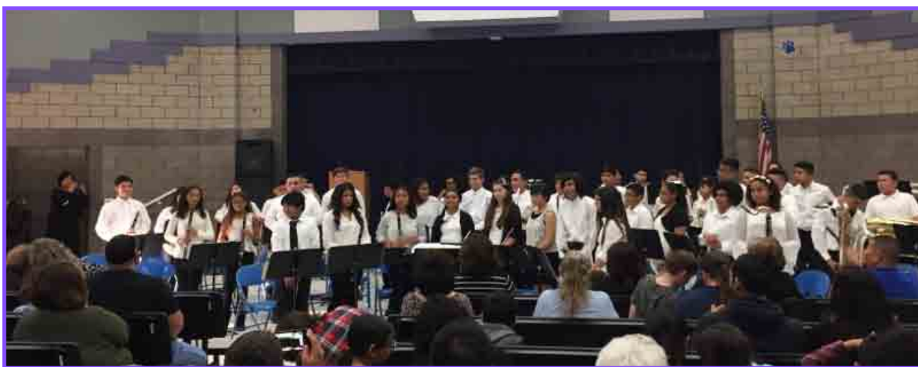
7 and 8th Grade Honor Band